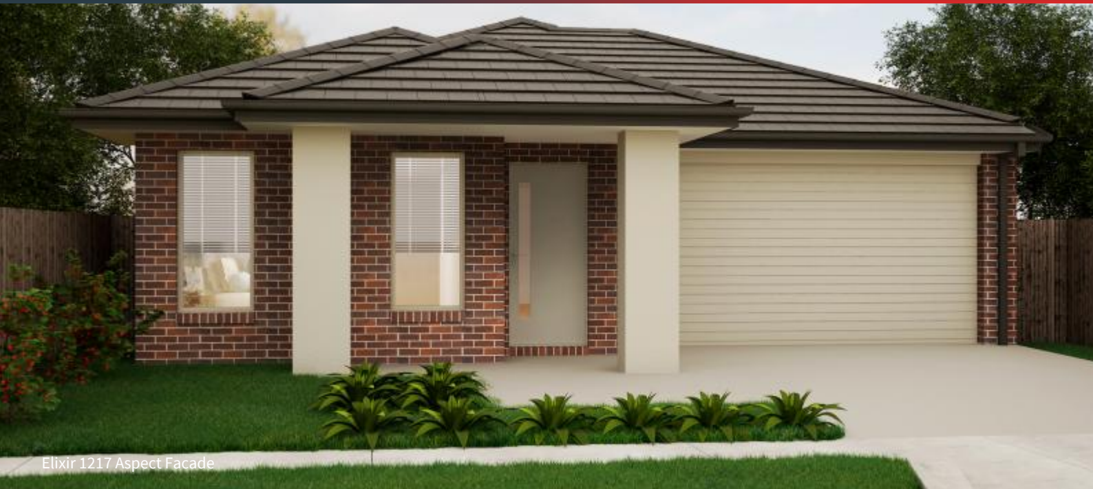
Elixir 1217 Aspect Facade

LOT 1503 BARTLE WAY, PEPPERCORN HILL, DONNYBROOK