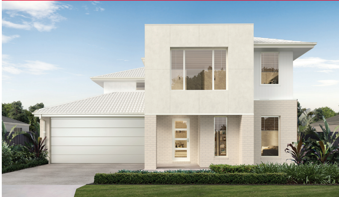
PEARSON 24_224 | METRO RANGE