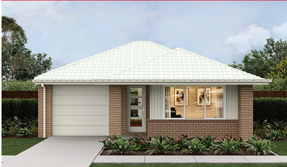
WEBBER 18_169 | METRO RANGE